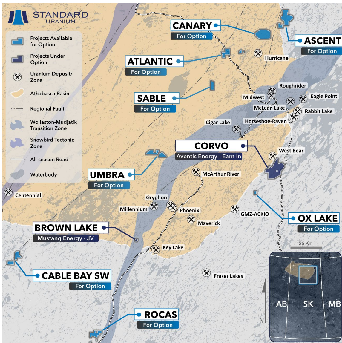
Figure 1. Overview of the eastern Athabasca Basin region highlighting Standard Uranium’s projects under option and available for JV.