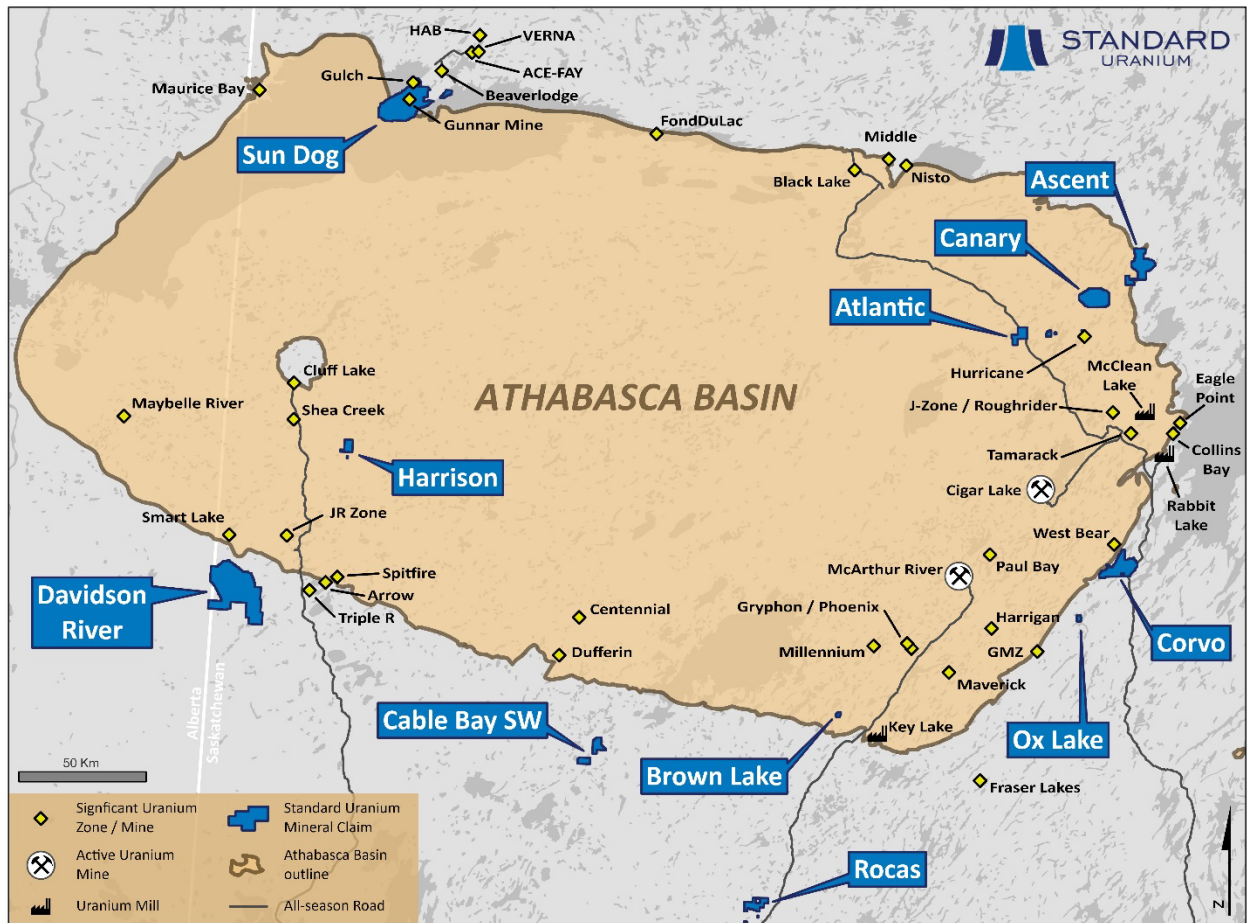
Figure 1. Overview map of Standard Uranium’s eleven Athabasca properties, including the newly staked Harrison project.